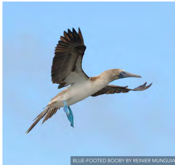
BLUE-FOOTED BOOBY BY REINIER MUNGUÍA

Have breakfast onboard, then disembark at Baquerizo Moreno Port on San Cristóbal Island and drive to the Jacinto Gordillo Breeding Center to learn about the tortoise reproductive process and the programs to help maintain the species. Take the bus back to port for a visit to the Interpretation Center, which tells the story of the geological and human history of the islands and their conservation. After lunch, visit Cerro Brujo to walk on a white sand beach and observe sea lions, brown pelicans, marine iguanas, and blue-footed boobies. Later sail around Kicker Rock (León Dormido), a massive tuff rock that juts almost 500 feet above the ocean surface and serves as a nesting place for many sea birds. Overnight aboard Tip Top II. (BLD)