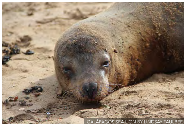
GALÁPAGOS SEA LION