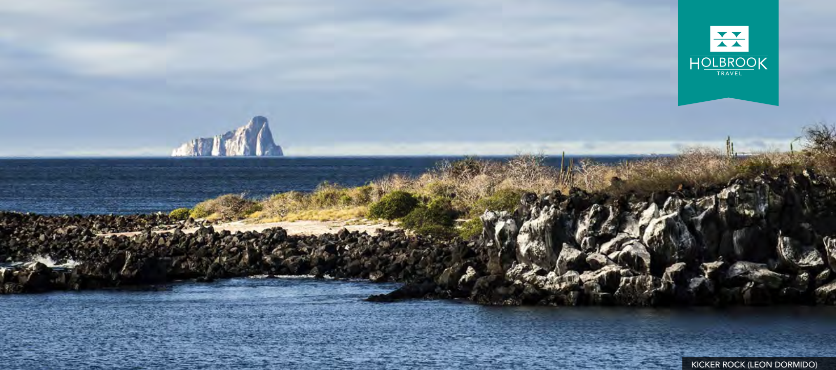
KICKER ROCK (LEON DORMIDO)