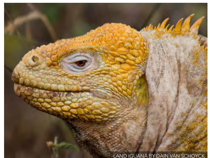
LAND IGUANA BY DAIN VAN SCHOYCK

Today go for a panga boat ride, landing at Prince Philip's Steps (El Barranco) on Genovesa Island to walk and observe the interesting lives of the birds here. Look for Nazca and red-footed boobies, Galápagos doves, Swallow-tailed gulls, and the Galápagos short-eared owl. Return to the yacht for lunch, then visit Darwin Bay, home to frigatebirds, herons, mockingbirds, boobies, shorebirds, turtles, marine iguanas, and more. Have dinner on the boat, and later attend an evening orientation to learn about conservation efforts to protect the islands. Overnight aboard Tip Top II. (BLD)