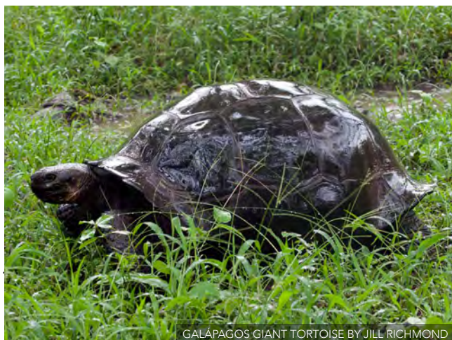
GALÁPAGOS GIANT TORTOISE